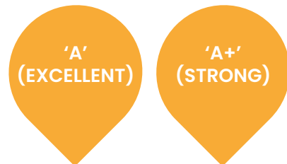
financial strength rating from A.M. Best