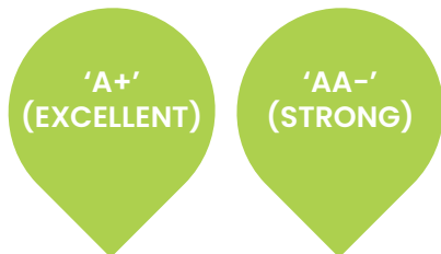
financial strength rating from A.M. Best